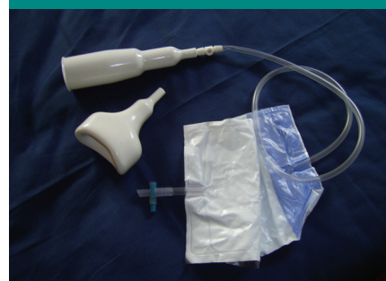
Figure 3: Male and female urine director/funnels (Beambridge Medical, Guildford).