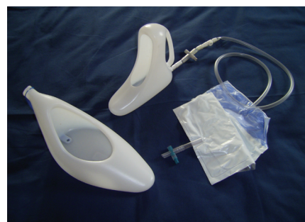
Figure 2: The Saddle Urinal™ (Beambridge Medical, Guildford) (above left) is designed in a wedge shape to enable it to be pushed down into the mattress. The Bridge Urinal™ (Beambridge Medical, Guildford), (above right) is designed to be used either in a bed or chair and can be attached to a drainage bag.

These systems rely on tension provided by belts and straps that need to be firmly applied and can take time for the skin to adjust to. These systems have